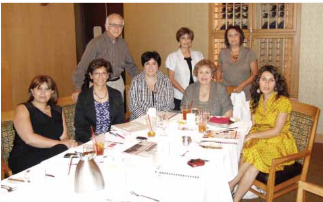
Board meeting, summer 2011, Glendale.