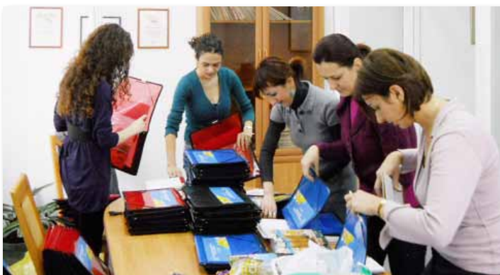
ABMDR staff and volunteers preparing conference packages.