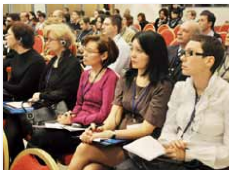
A scene from the conference.