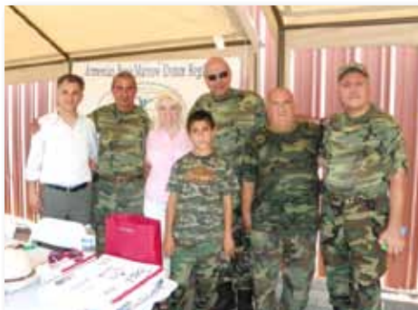
At Fresno Armenian Fest, with members of US Army Armenian Veterans.