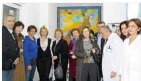
Delegates from Russia, Ukraine, and Kazakhstan at the ABMDR center, with ABMDR BOD members and staff.