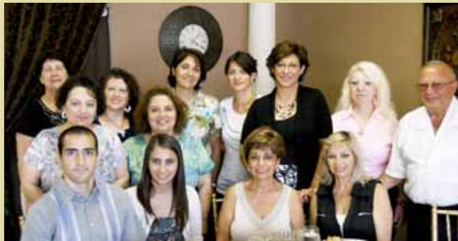
Meeting with leaders of Fresno's Armenian community.