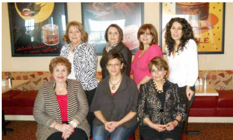
Board meeting, winter 2012, Glendale.