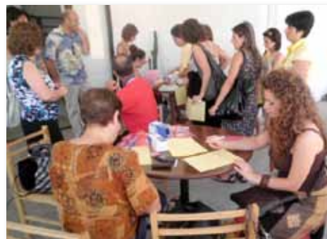
At Mkhitar Sebastatsi Educational Complex, Yerevan.