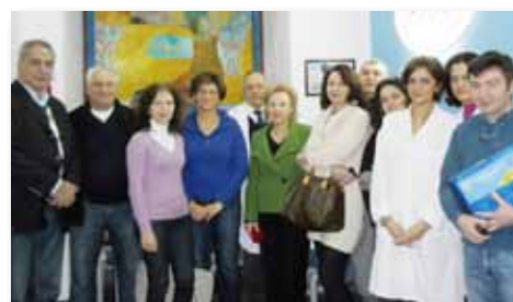
Georgian delegates with ABMDR Board and staff members at the ABMDR center.