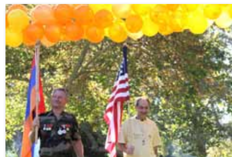
A US Army Armenian veteran walking side by side with the father of a patient.