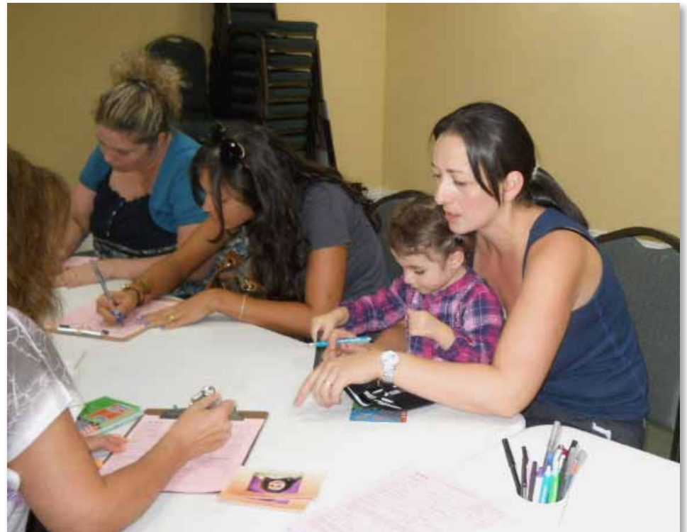
A scene from the recruitment at the Organization of Istanbul Armenians of Los Angeles.