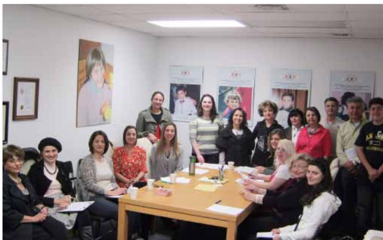
Recruitment Workshop in February 2012, at the ABMDR headquarters in Los Angeles.

To help stretch its budget and secure maximum grassroots activism alike, the Registry also participated in various community events hosted by churches, educational institutions, and youth organizations.