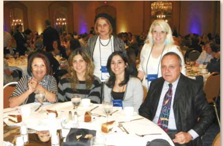
ABMDR participants of the National Marrow Donor Program Council meeting at the post-event dinner.