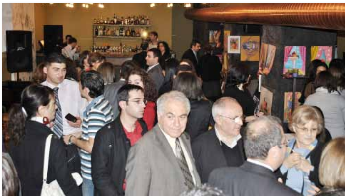
A scene from the AGBU Young Professionals of Yerevan's "Children Helping Children" event, held at La Bouchon Restaurant.