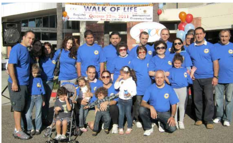
The Karoun Dairies team, major sponsors of the Walkathon.