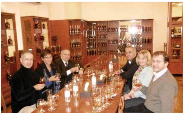
EFI guests and ABMDR Board members during cognac-tasting event at Ararat Brandy Factory, Yerevan.