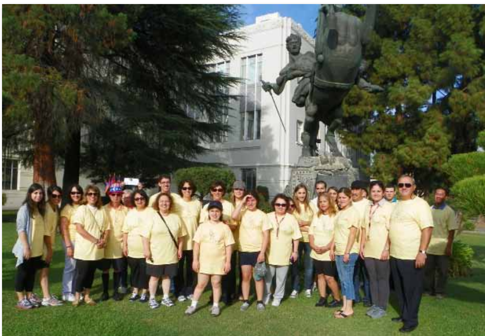
In front of the Statue of David of Sassoon, a landmark beloved of the Armenian community.