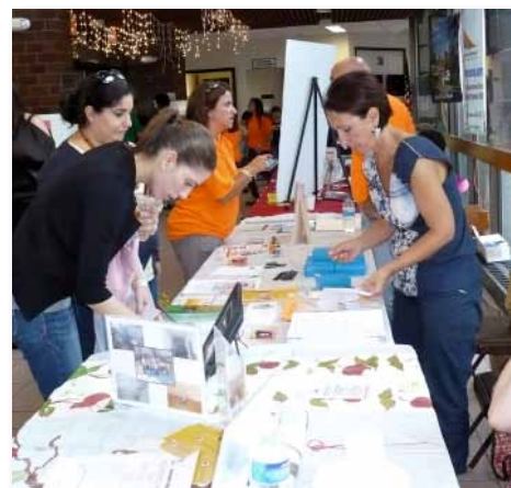
Scenes from the outreach and recruitment event during the annual Kermesse at the Armenian Cultural and Educational Center in Boston, September 2011.