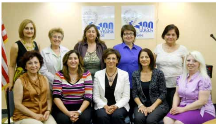
Visiting the Armenian Relief Society Western Region Board at the organization's Sipan Chapter in Glendale.

Throughout 2011 and 2012, the Armenian Bone Marrow Donor Registry engaged in several outreach events, aiming to help raise public awareness of the ABMDR mission, maintain synergistic relationships with Armenian-community institutions, and secure grassroots support for core programs.