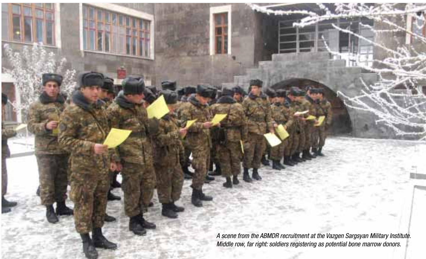
A scene from the ABMDR recruitment at the Vazgen Sargsyan Military Institute. Middle row, far right: soldiers registering as potential bone marrow donors.