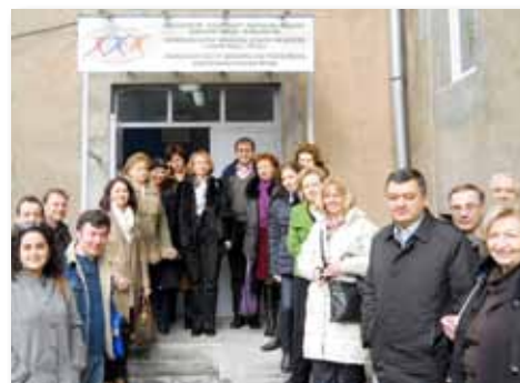
Conference participants in front of the ABMDR center.