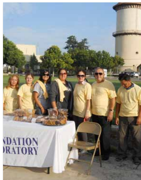
The team of Foundation Laboratory of Fresno, a major sponsor of the Fresno Walkathon and one of ABMDR's lifetime supporters.