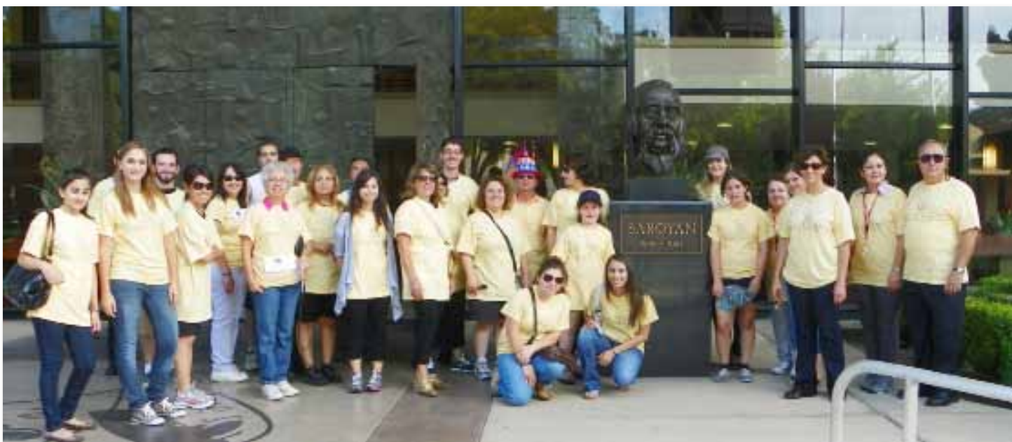
In front of the Saroyan Theater. The Armenian community of Fresno, the youth in particular, enthusiastically participated in the Walkathon.