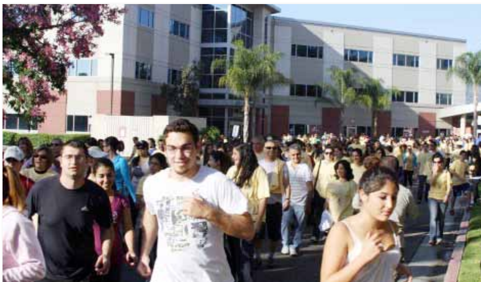
The young generation in action.