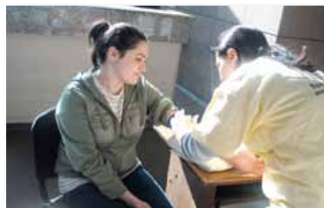
At the American University of Armenia, Yerevan.