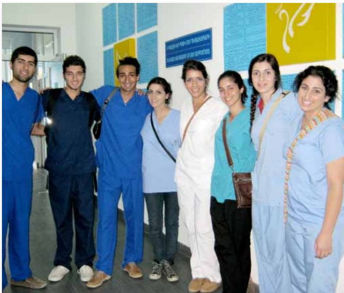
Members of the Armenian Youth Cultural Organization of the Western Diocese.