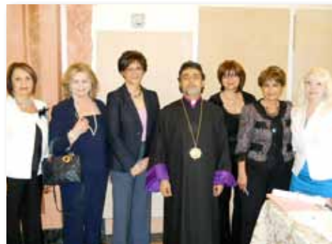
ABMDR Board members at Western Diocese, with Archbishop Hovnan Derderian.