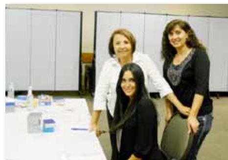
ABMDR volunteers and Board members at Glendale Memorial Hospital recruitment.