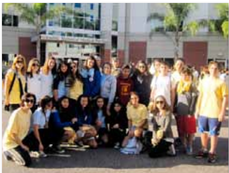
The AGBU Scouts team.