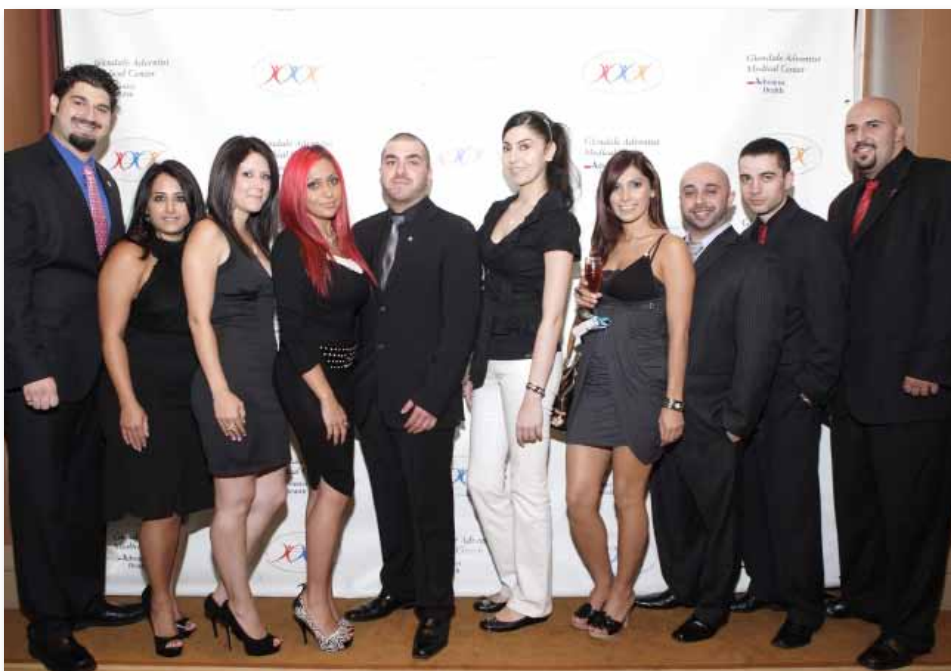
The 4over, Inc. team. The company received the ABMDR Business of the Year Award.