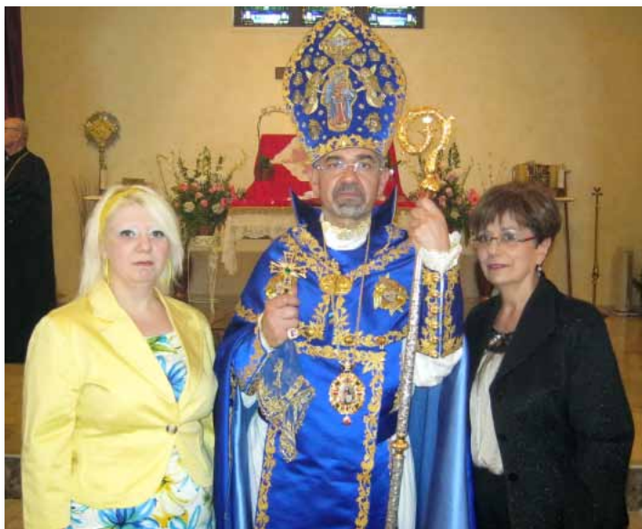
Prayer Day on April 15, 2012 (New Sunday), at the Armenian Apostolic Church of North Hollywood, with Archbishop Moushegh Mardirossian.