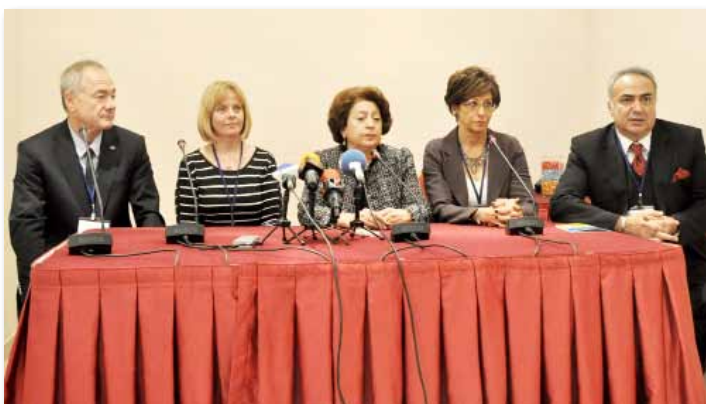
Joint EFI-ABMDR press conference.