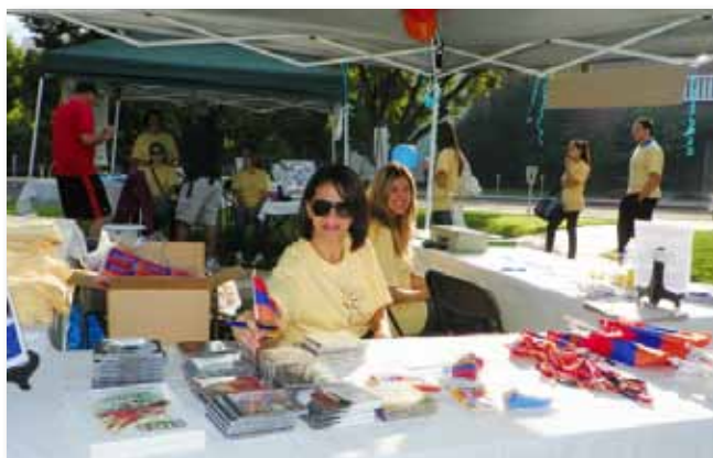
A scene from the Walkathon. Right photo: ABMDR recruitment booth on the grounds of the Eaton Plaza Amphitheater, site of the day-long community event.