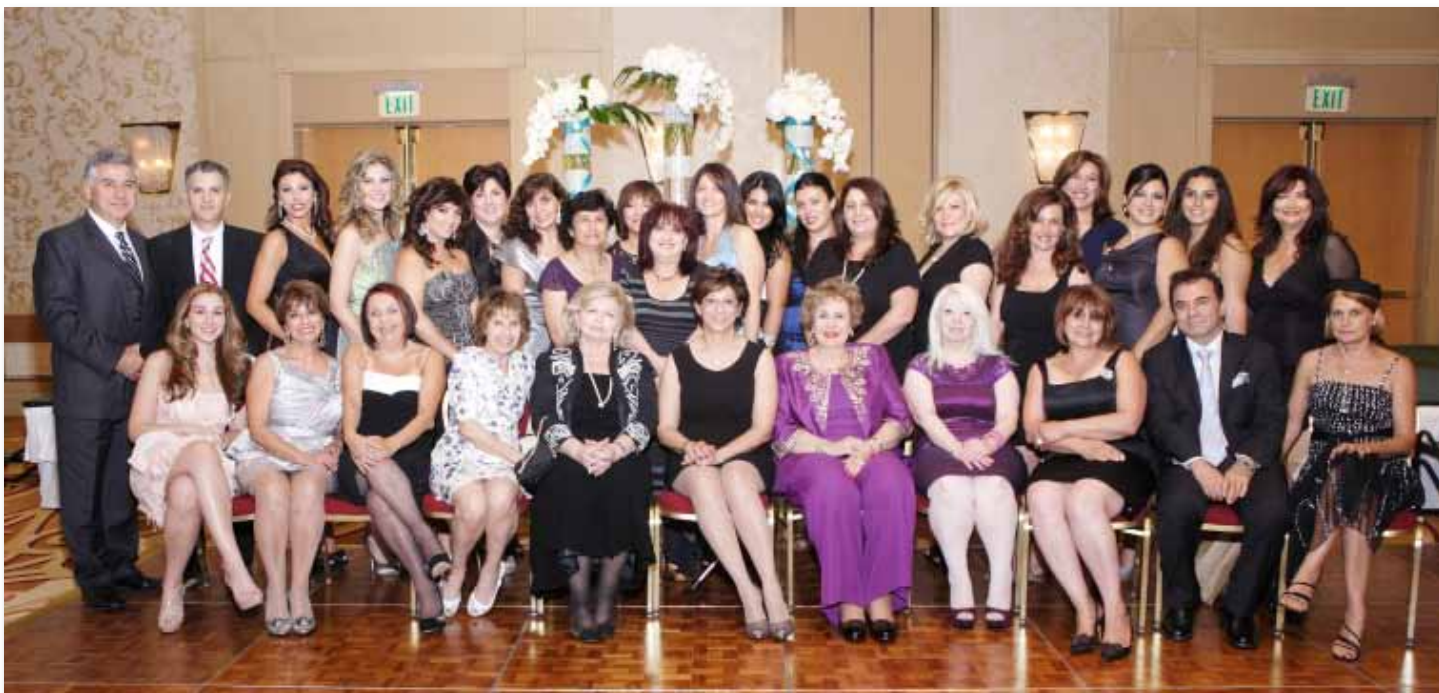
2011 Match for Life Gala Committee with volunteers and supporters. July 31, 2011, Glendale Hilton.

Scenes from the banquet hosted by ABMDR Honorary Chair Dr. Bella Kocharian on July 9, 2011, in Yerevan. The event was held to celebrate the Registry's participation in the Armenian Medical International Committee meeting, as part of the Third International Medical Congress of Armenia (July 7-9, 2011).