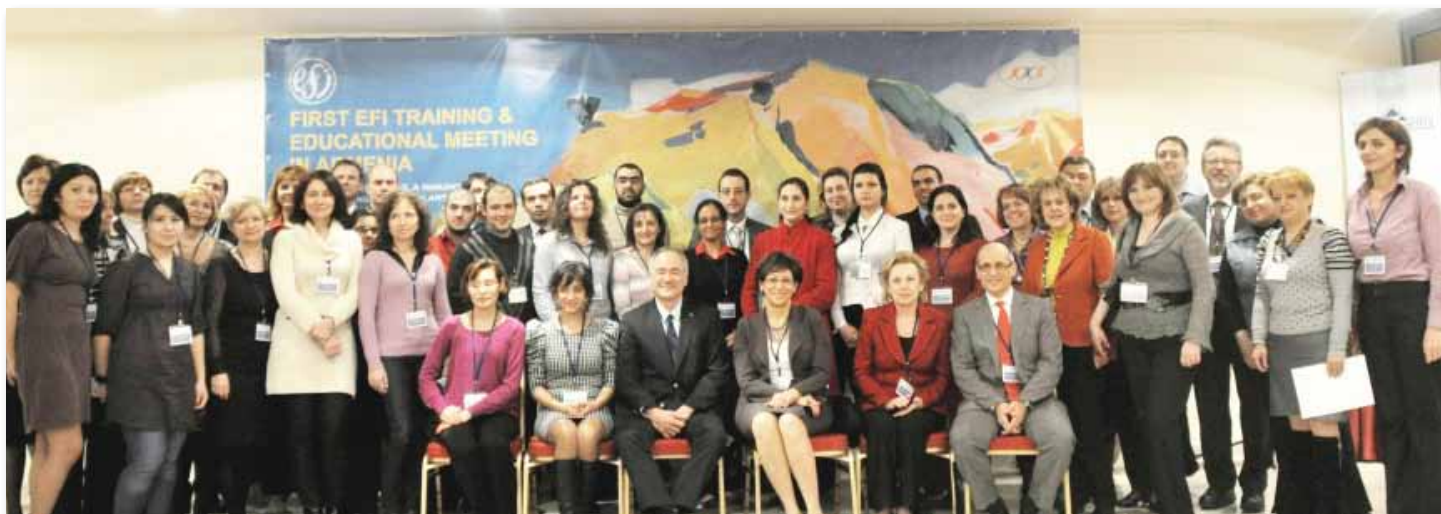
EFI conference participants including ABMDR and EFI board members, speakers, and ABMDR Yerevan lab staff.