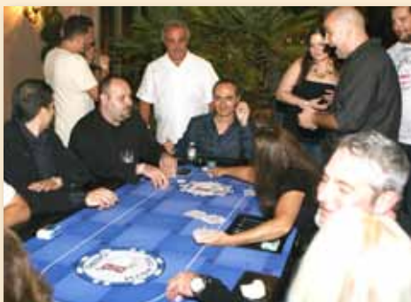
Everyone is a winner at ABMDR's second annual Casino Night.