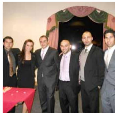
The USC AGSA Event Committee.