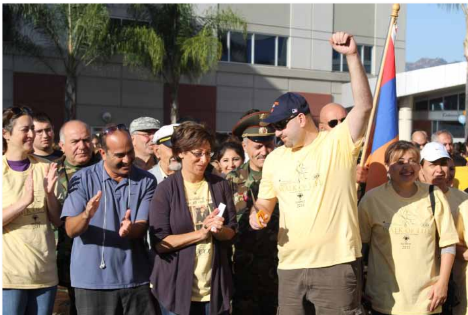
The ribbon-cutting ceremony at Glendale Memorial Hospital, October 22, 2011. Glendale Memorial Hospital has been a major supporter of Walk of Life for the past six years.

Major sponsors for Walk of Life 2011 included Karoun Dairies and Glendale Memorial Hospital and Health Center.