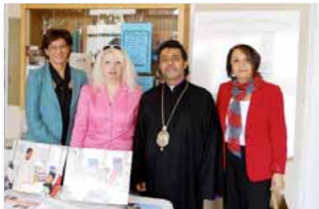
At St. Garabed Church in San Diego, with Archbishop Hovnan Derderian.