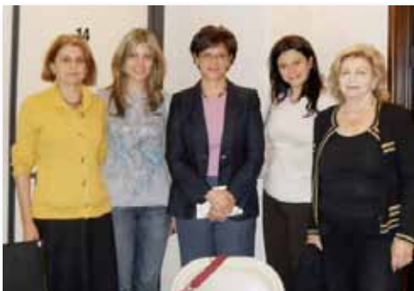
At St. Gregory the Illuminator Church, Pasadena.