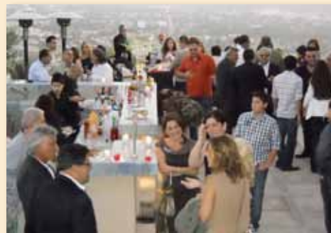
A scene from the Comedy Evening, which drew a large number of supporters and comedy aficionados.