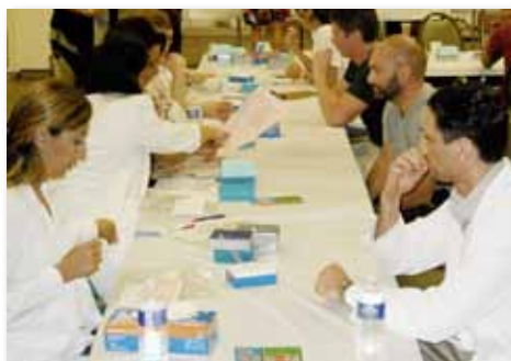
A scene from the recruitment at Glendale Adventist Medical Center.