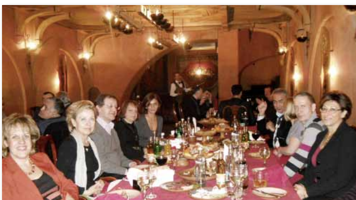
EFI guests and ABMDR Board members during a dinner reception.