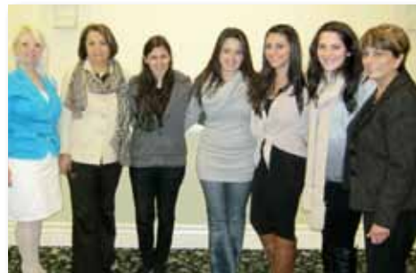
At AYF of Santa Ana, California: the Organizing Committee with ABMDR Board members.