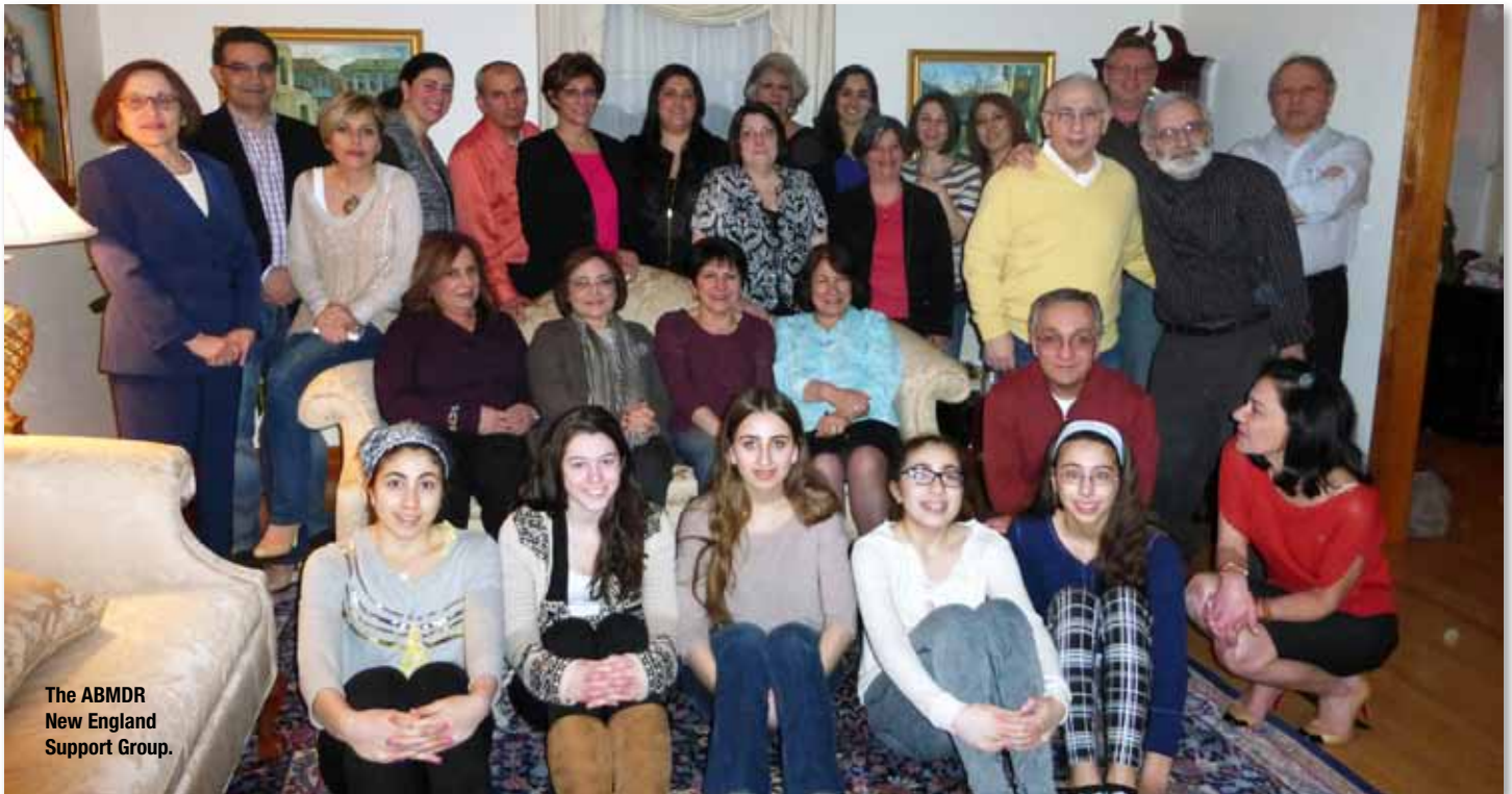
The ABMDR New England Support Group.