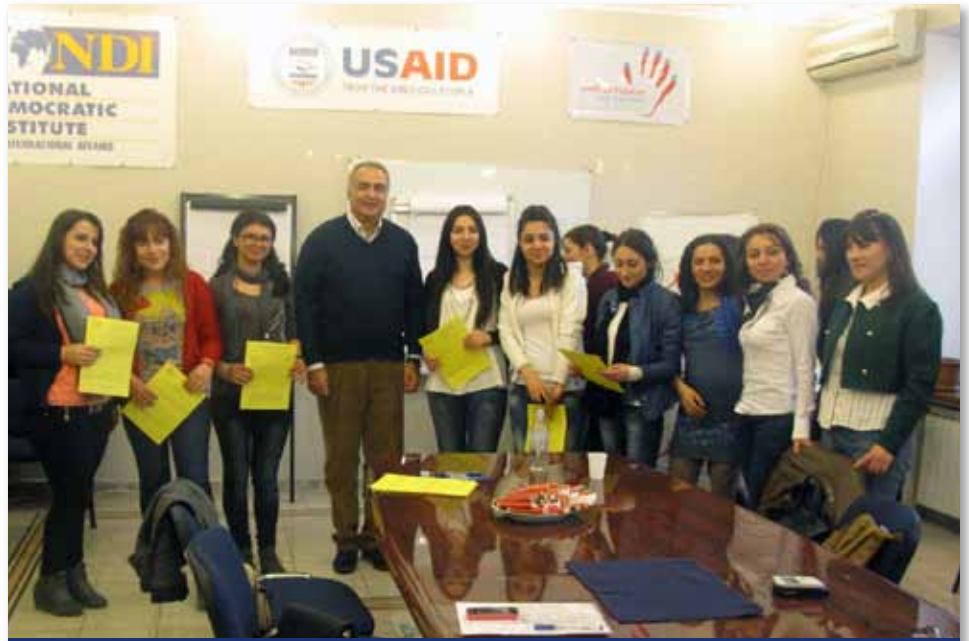
Thank you, NDI! In 2014, the National Democratic Institute of Armenia once again helped ABMDR organize recruitments and outreach events in the homeland, drawing the enthusiastic participation of supporters.